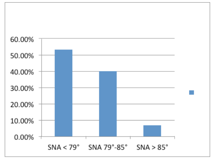
Table 2. SNA Cephalogram

growth disturbance. Hence, surgery has a great impact on the development of maxillary hypoplasia.<sup>11</sup>